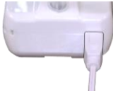
Figure 1 – Power cord